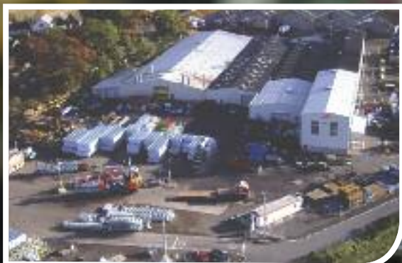
Ritchie Factory, Forfar Scotland

We strive to promote local business links within our own community, as well as the wider East Coast of Scotland through the Tayside Engineering Network and The Angus Training Group.